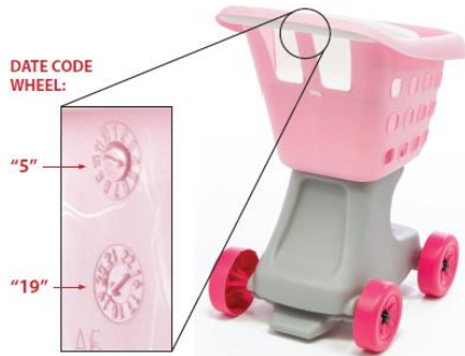
Recalled Step2 Little Helper's shopping cart, model 8567KL, with date code location