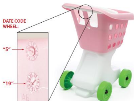
Recalled Step2 Little Helper's shopping cart, model 708500, with date code location